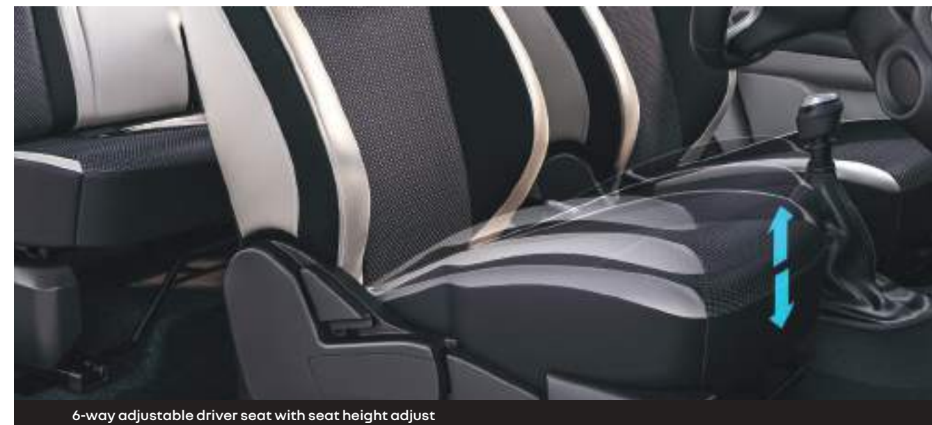
6-way adjustable driver seat with seat height adjust

The Renault TRIBER is sure to make heads turn with the widest range of attractive body colours in its segment with ORVMs and roof in mystery black. The range also features a first-time trendy Cedar Brown body colour. The new TRIBER stands out with Stylish Roof Rails , SUV skid plates and LED DRLs . The 3-part ultra-modern Triple Edge Chrome Front Grille and Styled Flex Wheels further add to its presence.