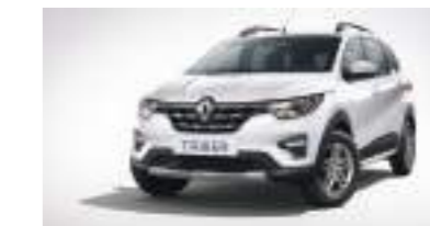
ice cool white