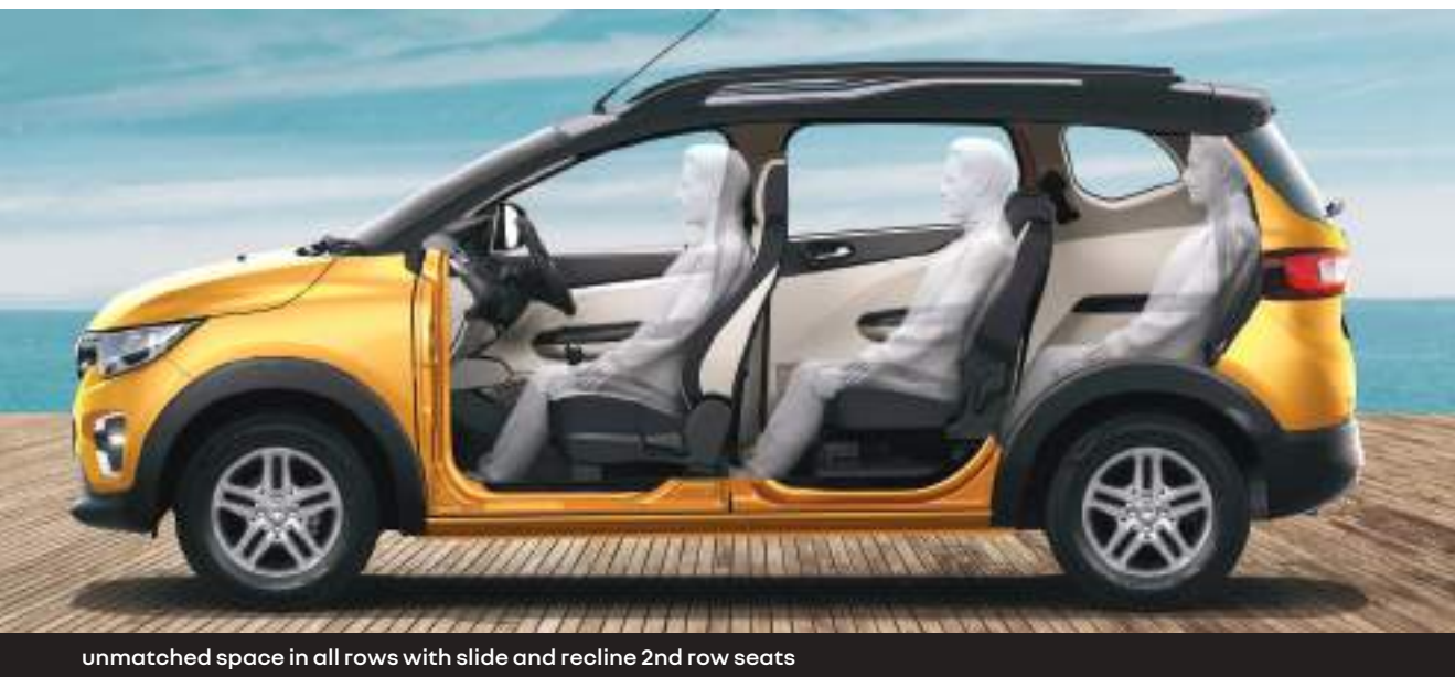
unmatched space in all rows with slide and recline 2nd row seats