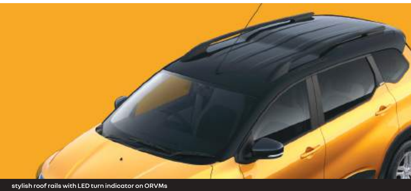
stylish roof rails with LED turn indicator on ORVMs