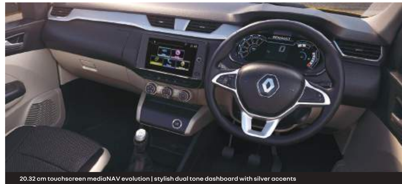
20.32 cm touchscreen mediaNAV evolution | stylish dual tone dashboard with silver accents