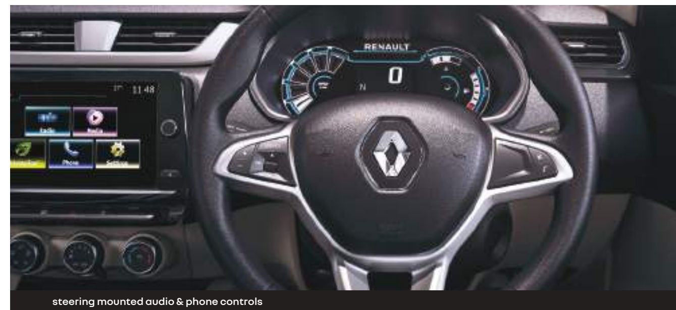
steering mounted audio & phone controls