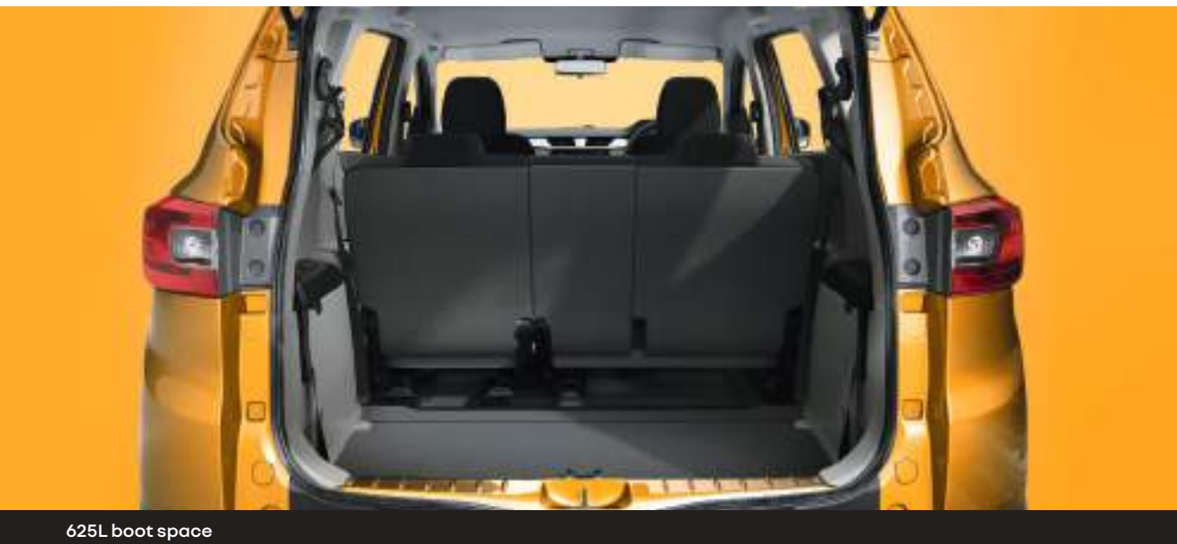
625L boot space