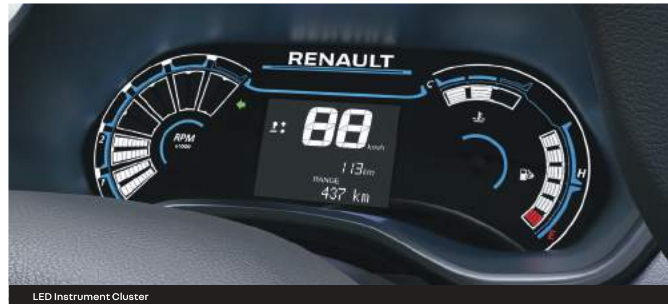
LED Instrument Cluster

The Renault TRIBER has been thoughtfully designed to accommodate comfort and convenience. It features the best-in-class passenger cabin space available in a sub-4m car. The TRIBER comes with a best-in-class boot space of 625L (5-seater) and interior storage of up to 24L including upper and cooled lower glove boxes . Go ahead, discover space like never before.