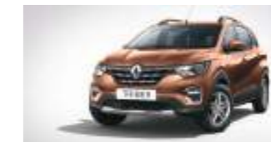
new cedar brown