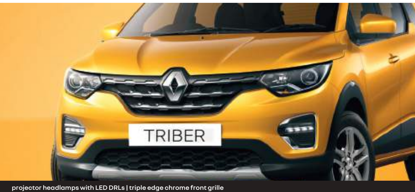
projector headlamps with LED DRLs | triple edge chrome front grille