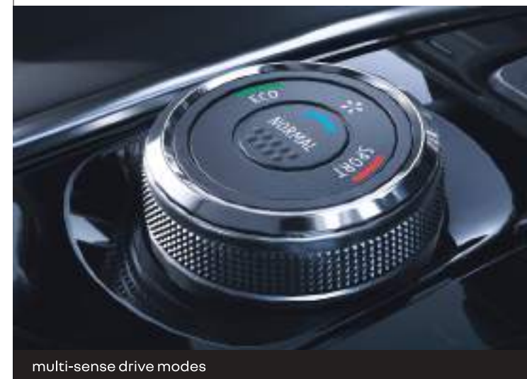
multi-sense drive modes