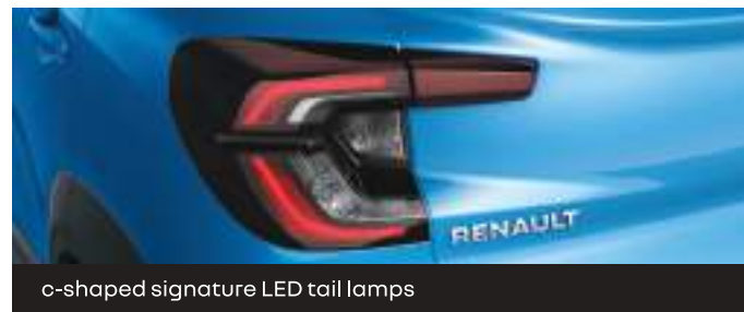
c-shaped signature LED tail lamps