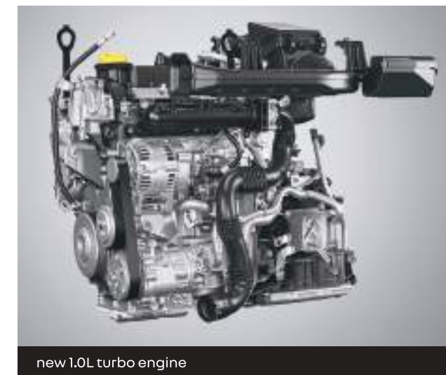
new 1.0L turbo engine