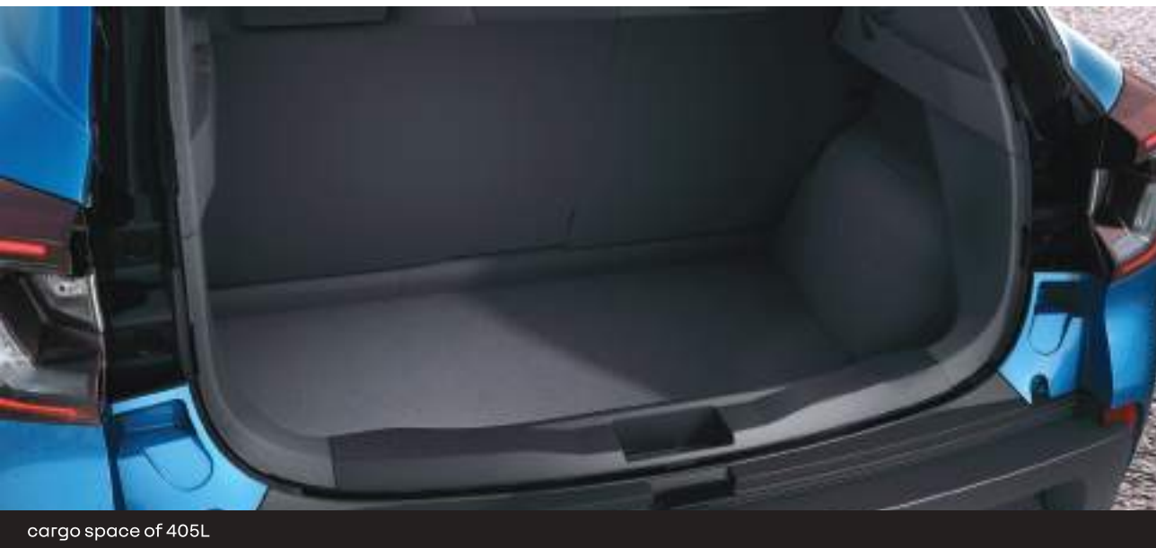
cargo space of 405L