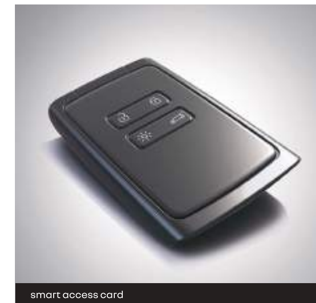
smart access card

The Renault KIGER's smart interiors are designed to make every trip memorable. It features Android Auto/Apple CarPlay with wireless smartphone replication and 3D sound by ARKAMYS® for an exciting in-car entertainment experience. Smart technology inside continues in Push Start/Stop, Smart Access Card, rear view camera and Auto AC.