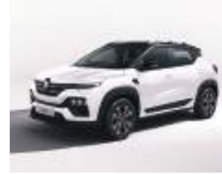
ice cool white