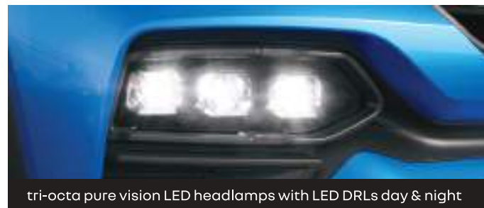
tri-octa pure vision LED headlamps with LED DRLs day & night