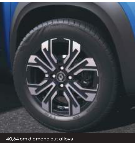
40,64 cm diamond cut alloys