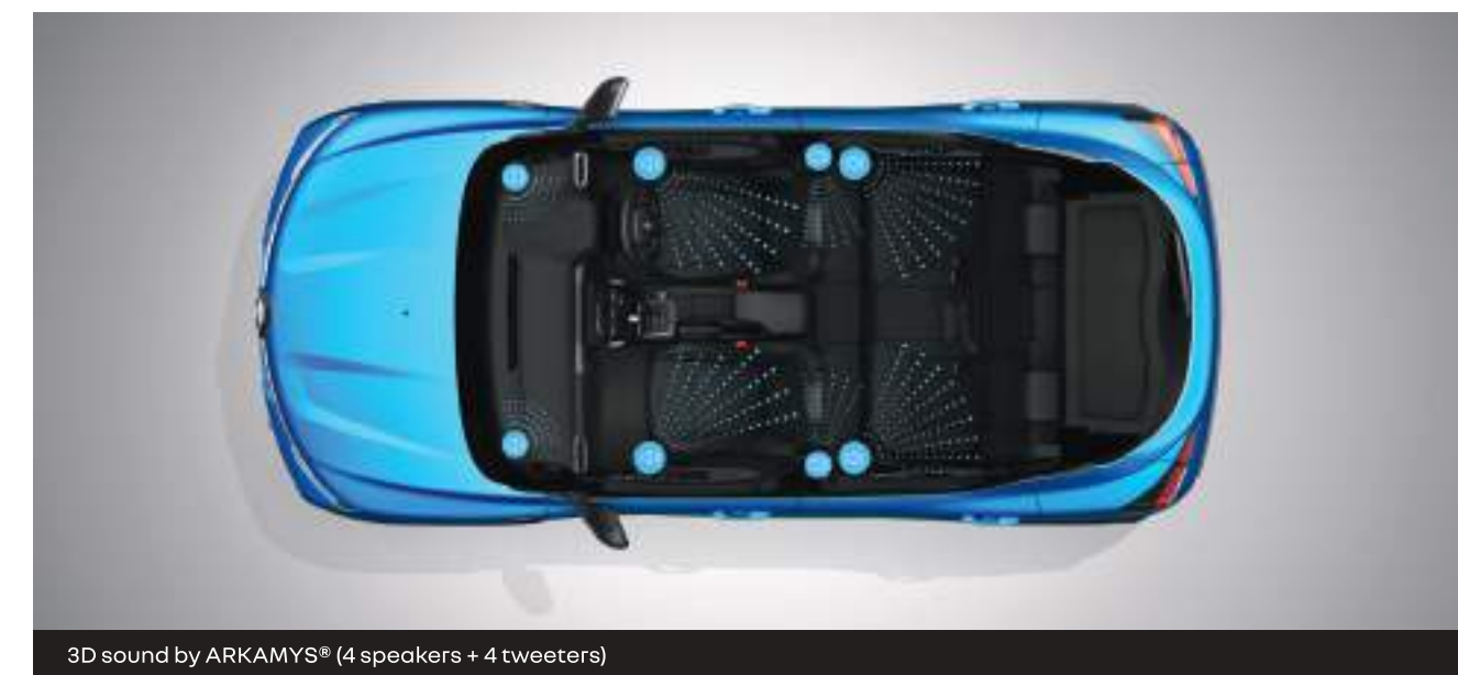
3D sound by ARKAMYS® (4 speakers + 4 tweeters)