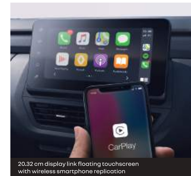
20.32 cm display link floating touchscreen with wireless smartphone replication