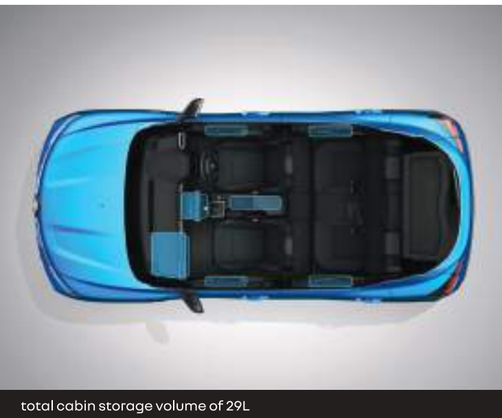
total cabin storage volume of 29L