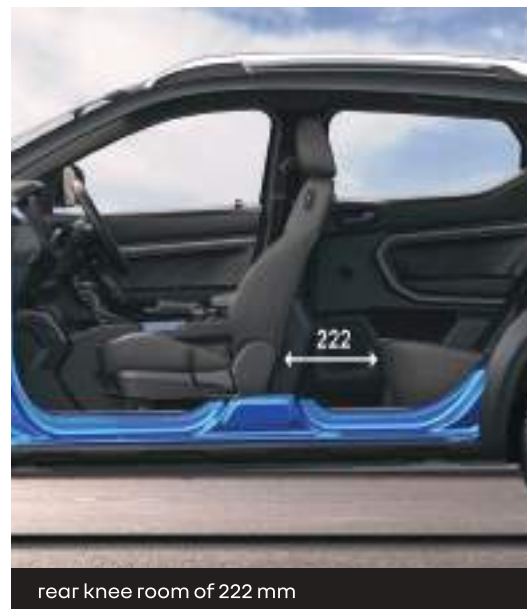
rear knee room of 222 mm