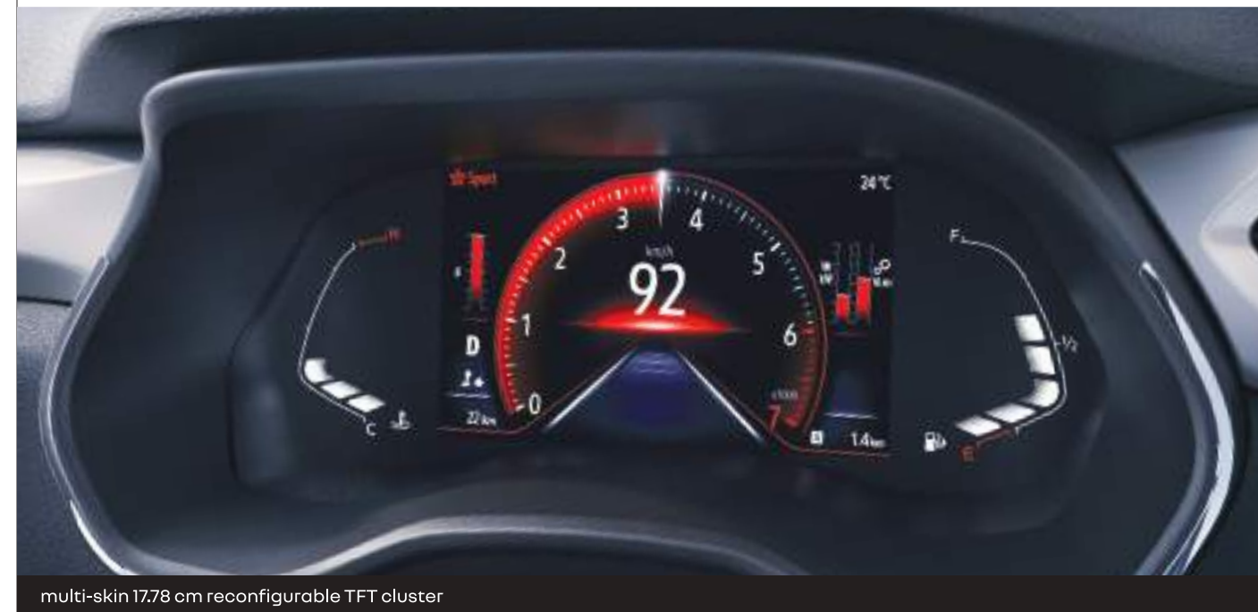
multi-skin 17.78 cm reconfigurable TFT cluster

The Renault KIGER's high cabin storage volume has you ready for the new, when you hit the road with your group. Get space for all your belongings with the 405L cargo space that can be enhanced to 879L by folding rear seats. There's also additional storage space of 14.9L in upper and lower glove boxes and 7.5L in the centre console storage compartment. The KIGER's rear row comes with a knee room of 222 mm, a flat floor and elbow width of 1431 mm to help comfortably seat three.