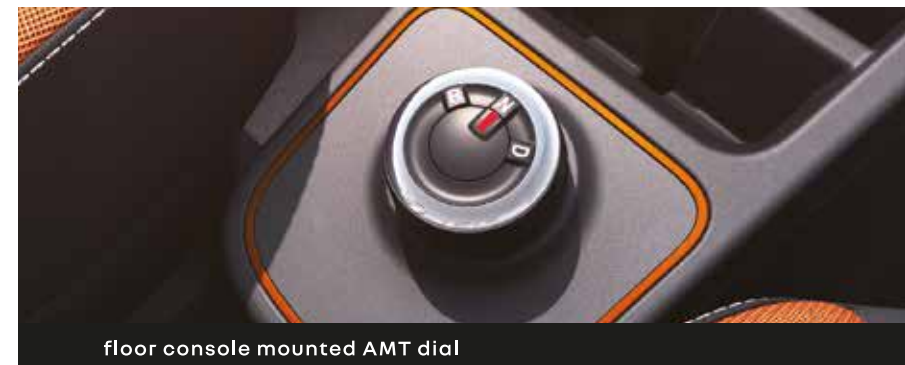
floor console mounted AMT dial

*present in MT versions only. ^ first to introduce this feature.