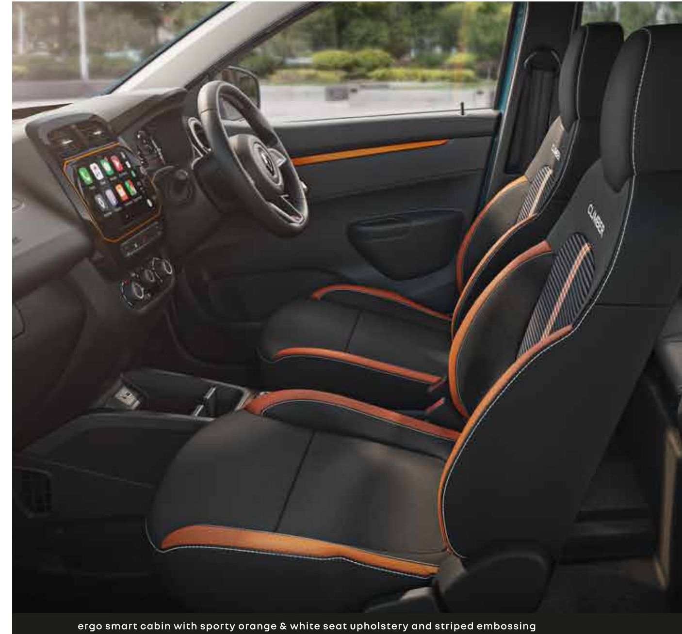
ergo smart cabin with sporty orange & white seat upholstery and striped embossing

*present in MT versions only. ^ first to introduce this feature.