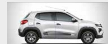
ice cool white**