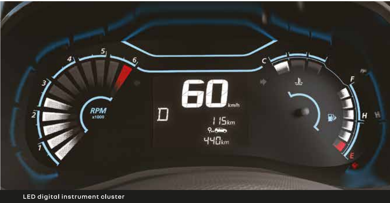
LED digital instrument cluster

The Renault KWID's Smart Control Efficiency (SCe) engine technology for accurate air-to-fuel ratio monitoring optimises performance and fuel efficiency. The suspension system of the Renault KWID is calibrated for an optimum ride. Choose between the peppy 1.0L engine or the fuel-efficient 0.8L engine and make the most of every drive.