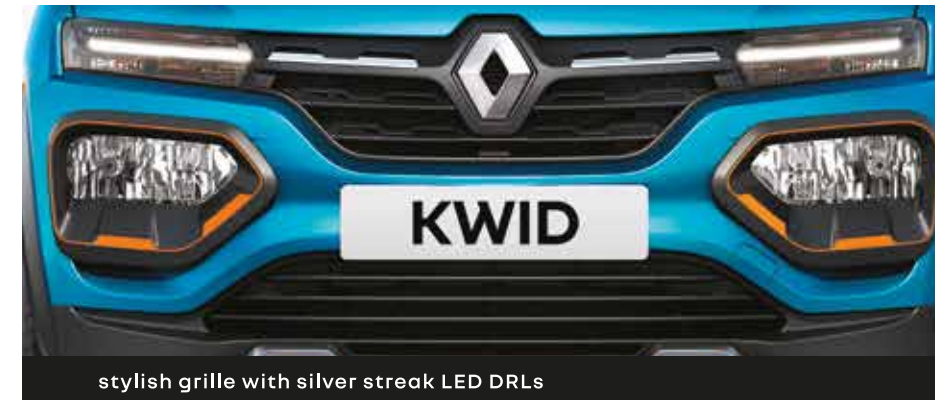
stylish grille with silver streak LED DRLs

Say hello to the latest showstopper in town.