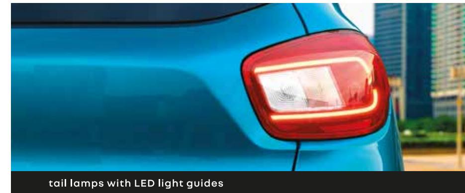
tail lamps with LED light guides