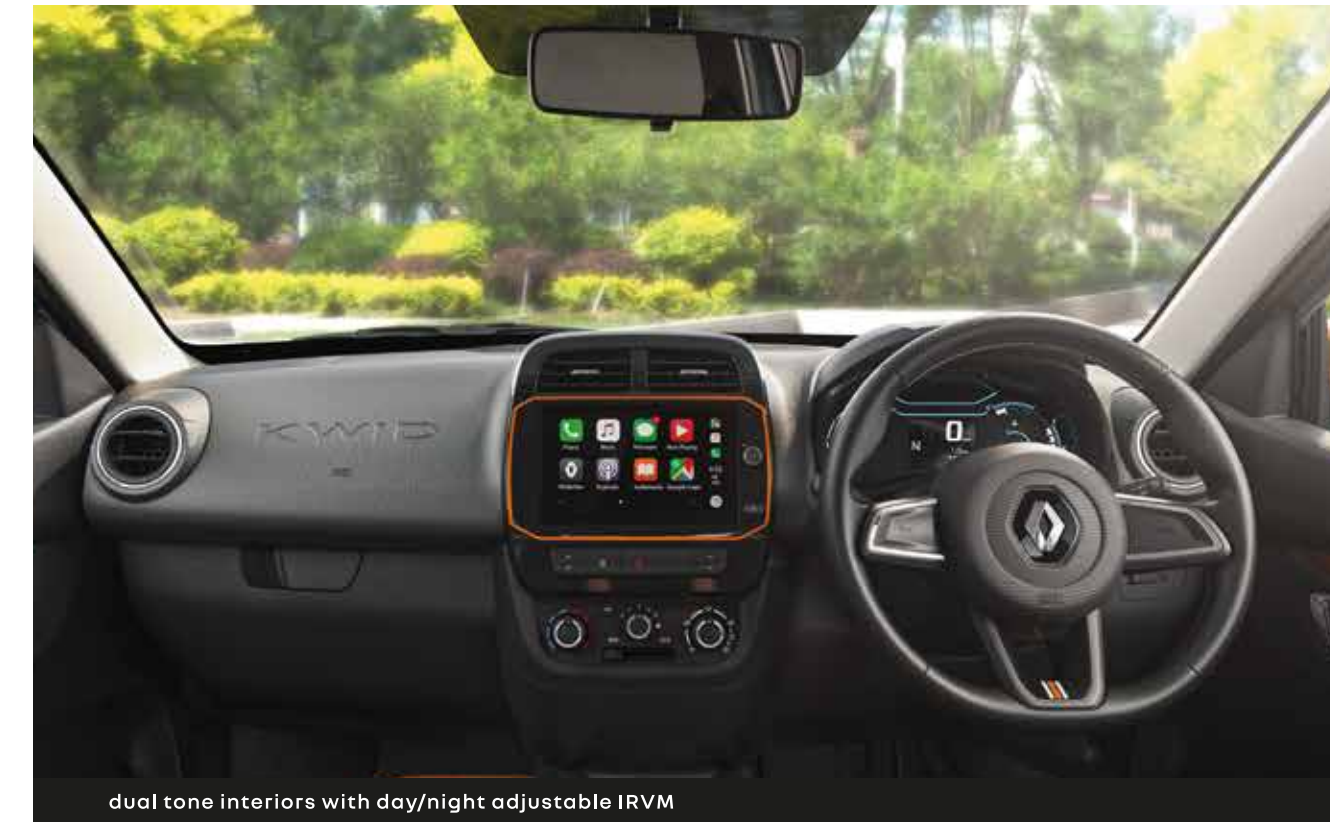
dual tone interiors with day/night adjustable IRVM

The Renault KWID comes with dual tone interiors & a spacious, comfortable Ergo Smart cabin. The front-seats are 4-way adjustable to give the most ideal seating and driving position. This is accentuated by Sporty Orange & White Fabric Seat Upholstery with Striped Embossing. The Sporty Steering Wheel, Stylish Dashboard with a Piano Black Centre Fascia, Touchscreen MediaNAV Evolution with Sporty Orange Surrounds*, AMT Dial Surrounds in Sporty Orange along with Sporty Orange accent add a touch of vibrancy.