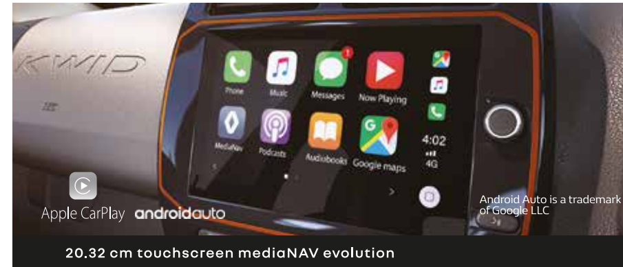
20.32 cm touchscreen mediaNAV evolution